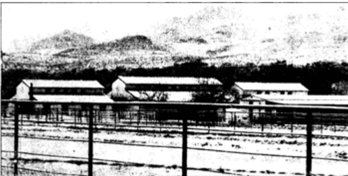
POTREROS RANCH is the name of the 165-acre ranch Global Community Communications Alliance, formerly known as Aquarian Concepts Community, recently purchased near Tubac. Six acres are zoned "multi-family" while 159 acres are zoned "general rural," according to the Santa Cruz County Assessor's Office.