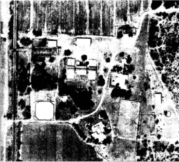
An aerial view of Potreritos Ranch