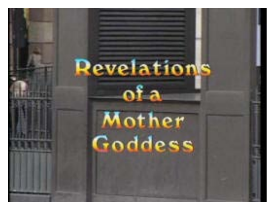
Revelations of a Mother Goddess