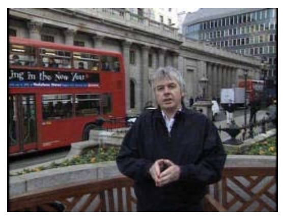
[David Icke] Hello, and welcome to the City of London, a city within a city.