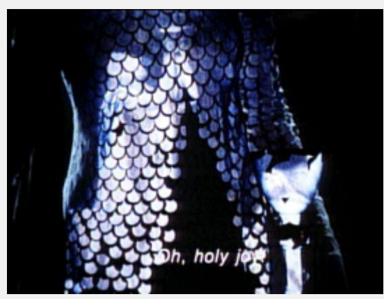
Oh, holy joy!