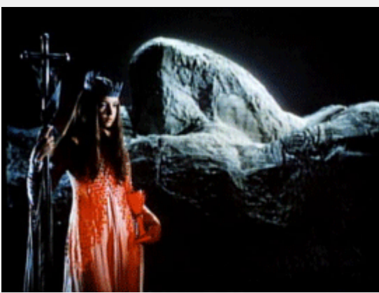
Take this my body in the name of our love. Take this my blood, take this my body, in remembrance of me.