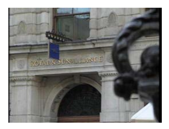
We go around here, we've got the Royal & Sun Alliance Insurance Company.

The flag: that's the flag of England. And that symbol goes right back into the ancient world. It was the ancient sun symbol of the Phoenicians back in the ancient, and middle, and near east. And the Phoenicians had a number of deities. One of them was called Bharati, the female. One was called Barat, the male. Bharati and Bharat became Britannia and Britain, because the British culture was brought here by the Phoenicians about 3,000 B.C. and after. And they also had deities -- the Phoenicians -- called St. George of Cappadocia, who killed the dragon. That became St. George of England. And that's, of course, the flag of St. George -- the red cross on the white background today. Also, the Christian deity called St. Michael was an ancient Phoenician deity long before Christianity. So the Mansion House, the center of government, is a very, very powerful place.