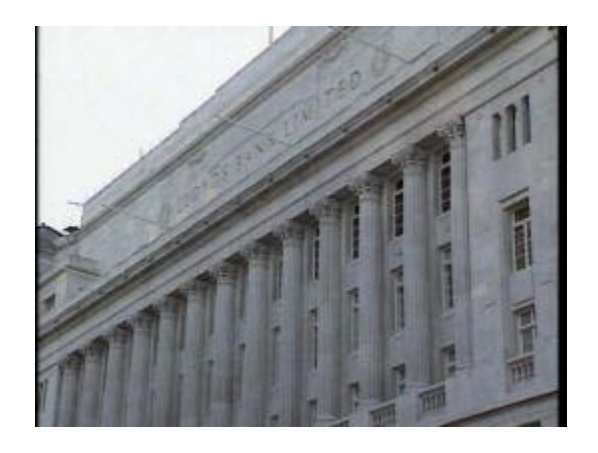
Over there we've got the Lloyd's Bank Building.

If you know it's going to crash, you sell your stock, it crashes, and you buy it back at a lower price. You then push it back up again, and buy other stock at the same time for a few cents on the dollar or whatever. And that means that a financial crash can actually lead, if you know it's coming, because you're creating it, to an amazing expansion of your holdings and your wealth.